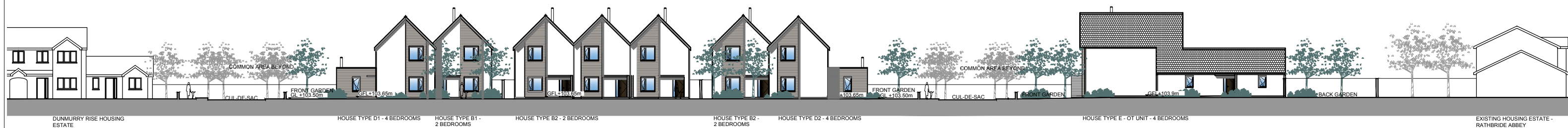
E3 ELEVATION SCALE: 1:200