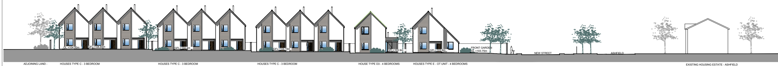
E4 ELEVATION SCALE: 1:200